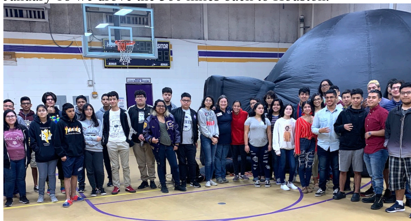
Left: San Benito High School students after a dome show. All of them fit in the 6 dome!

On January 17, we set up the dome at San Benito High School and reached eight groups of high school students (35-40 in each group), also showing the “Impact” show and a live star show. On January 18 we drove the 360 miles back to Houston.