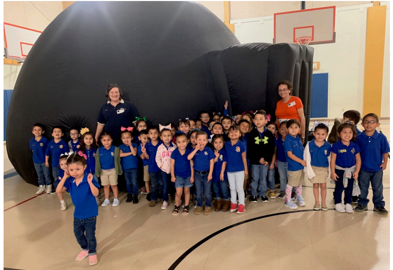
Above: Collins Parr elementary students after the show; left: students in the dome