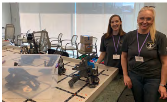
Left: girls making spectroscopes to view line emission; top: Mars robots from Space Center Houston; lower left: chemistry of dyes; lower right: speed racer design