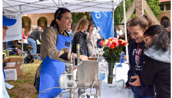
Above: Cheniere Energy Booth

The event began with a street fair from 11-1, with 28 exhibit booths covering a wide range of STEM activities. Principal sponsor Cheniere Energy had a popular booth demonstrating the LNG process.