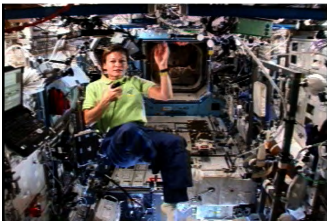
Above: Peggy Whitson sending a message to the Sally Ride Festival participants in 2007. She returned in person in 2008 and 2018.

History The first Rice festival was held in 2006, at the request of Sally Ride, who was the first keynote speaker. It was originally called the “Sally Ride Science Festival”. Other keynote speakers have been Eileen Collins (2007); Peggy Whitson (Rice PhD 1985) (2008 and 2018); Ellen Ochoa (2009); Wendy Lawrence (2010 and 2015); Catherine Coleman (2011 and 2014); and Barbara Morgan (2013). In 2007