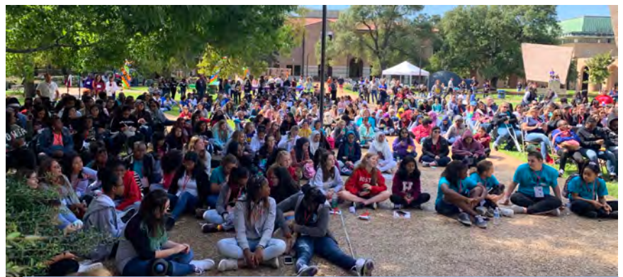
Above: the girls enjoyed the talk on the quad in the beautiful weather

Other exhibitors included NASA, Lunar and Planetary Institute, Baylor College of Medicine (TRISH and also the deBakey Dept of Surgery), Texas Space Grant, Mobile Aviation Lab, Solar System Ambassadors, Lab Rats Robotics, Houston Geological Society, American Chemical Society, Association of Women in Science, University of Houston and UH - Downtown, Costello Engineering and Celanese. Rice groups exhibiting included R-STEM, the Tapia Center, Association of Women in Math, Discovery Dome, Solar Telescope, Rice Physics, and Eclipse Club (Rice Rockets).