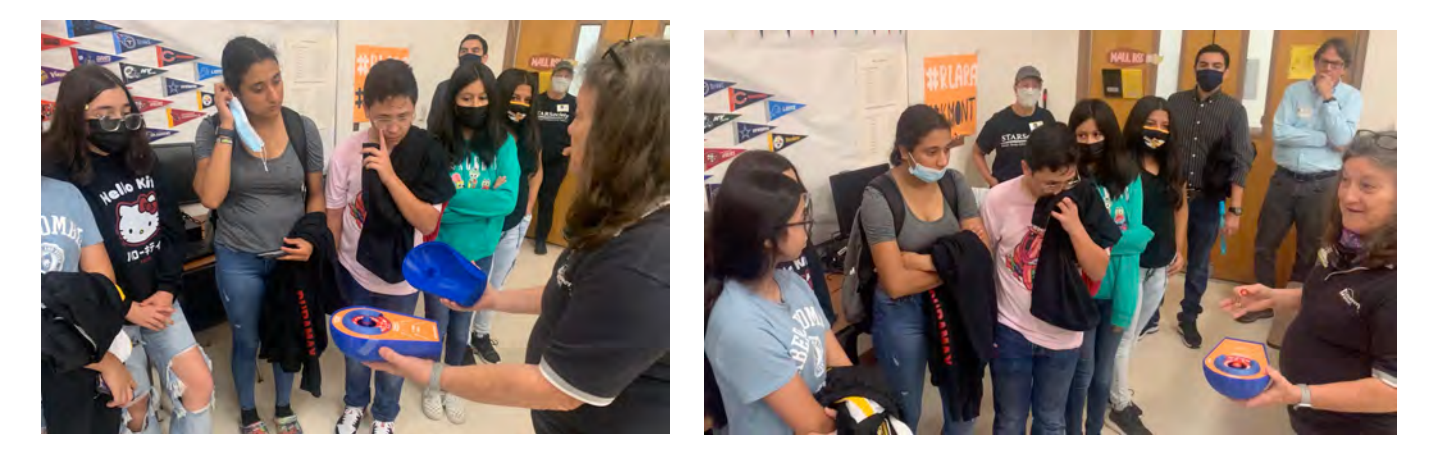
Figure 1: High school students learning about the magnetosphere using the 3D printed magnetosphere model, which includes the major plasma regions (plasmasphere, ring current, plasma sheet, aurora, cusp). They then went into the dome and saw the Magnetosphere show.