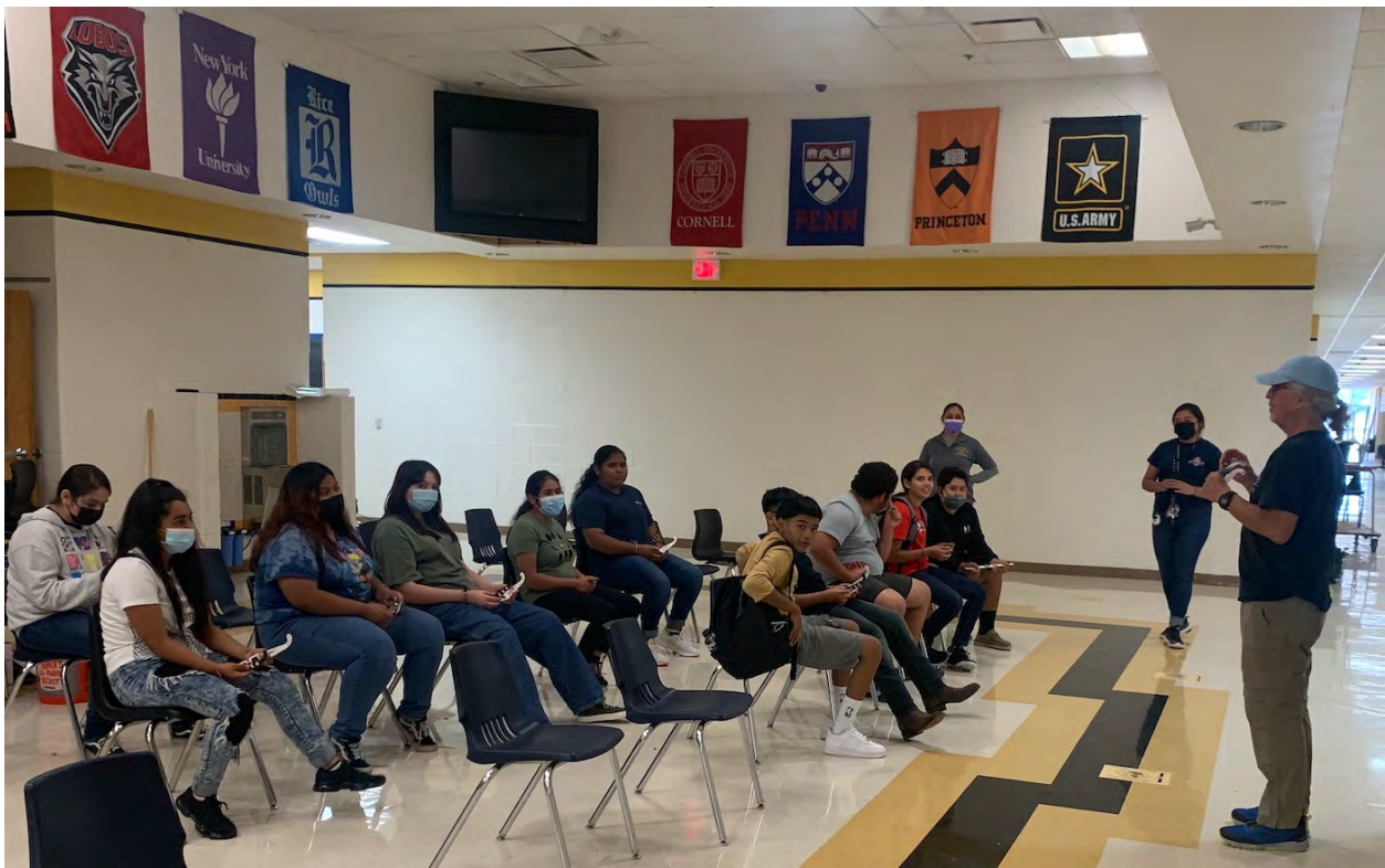
Figure 2: High School students learning safe eclipse viewing techniques from members of the South Texas Astronomy group.