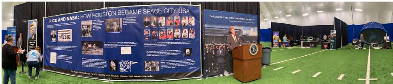
(view of the Rice exhibit in the football practice dome. The Discovery Dish is at the far right.)

September 12, was the 60 th anniversary of the John Kennedy “We Choose to Go to the Moon” speech. Rice University, NASA / JSC and NASA Headquarters collaborated on a major event in the Rice University stadium, plus the NASA exhibit trailer plus an exhibit of Rice activities in the football practice field. The exhibits were open Saturday, Sunday and Monday and reached over 4000, mostly families. We had one of our Dish planetariums on display with our show “We Choose Space” and “Apollo and Beyond” running. We gave out over 1000 eclipse glasses with an information sheet.